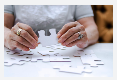
Trivia's, Educational Presentations, Science Experiments, Historical Programs, Nature-Based Programs, Art/Music History Appreciation, Book Club, Music Therapy